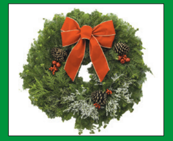
24" Boxed Decorator Wreath