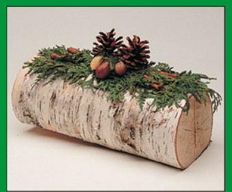
Holiday Yule Log 12"