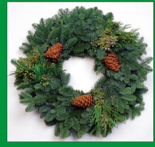
Noble Fir Mixed Wreath 20" Indoor/Outdoor