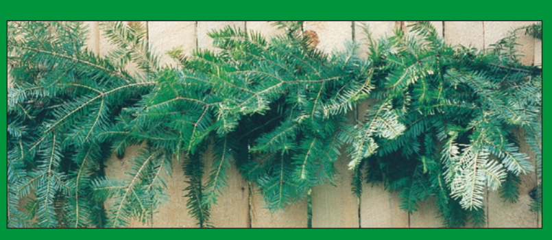
25' Balsam Fir Garland