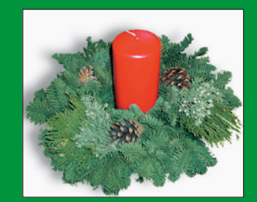
12" Candle Ring Wreath with 4" Candle