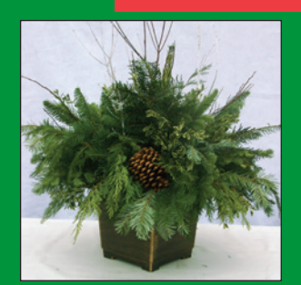
32" Evergreen Planter 38" Evergreen Planter