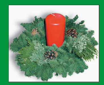
12" Candle Ring Wreath WITHOUT Candle