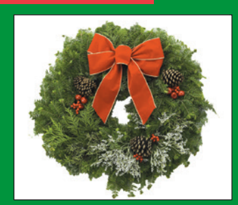
24" Boxed Decorator Wreath