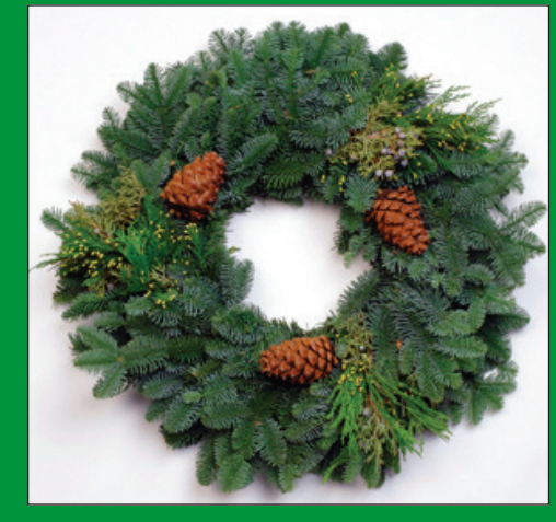
Noble Fir Mixed Wreath 20" Indoor/Outdoor