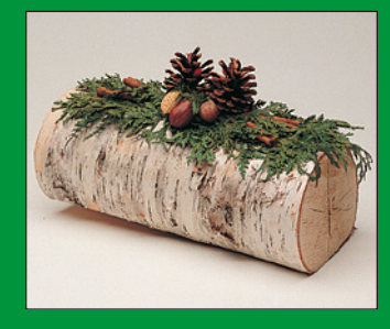
Holiday Yule Log 12"