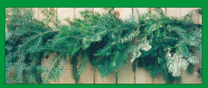
25' Balsam Fir Garland