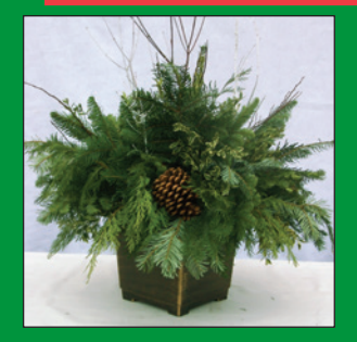
32" Evergreen Planter 42"+ Evergreen Planter